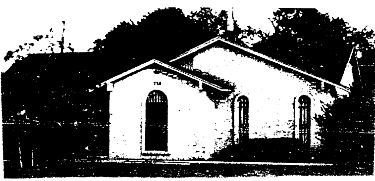
Chaityalaya in southern United States 538 Apollo Street, Richardson, TX 75080

The Jain Society of North Texas has had its growing pains during its early years and in the past three years, its growth persuaded the membership to further strengthen the roots of Jain Religion by establishing the Chaityalaya.