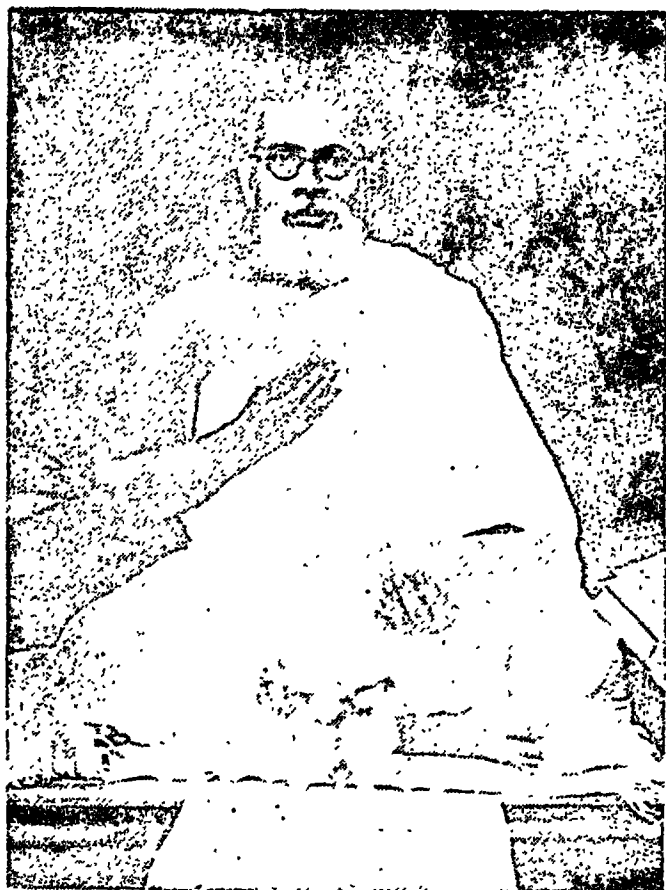
A Great Scholar, writer and orator Jain-Acharya Shri Vijaya Labdhi Surishwarji Maharaj.