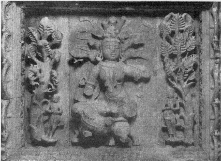
सिंहारूढ अम्बिका (?), लूण-वसहीनी एक छतनी कोतरणी, देलवाडा, तेरमी सदी

Ambikā (?) on Lion in the ceiling of Lūṇa-Vasahī, (Abu), 13th Century