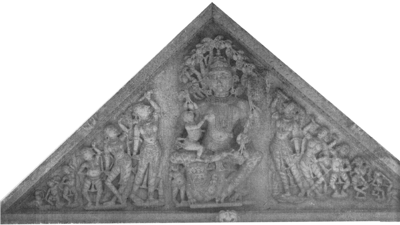
अम्बिका देवी, विमल-वसहीमांना रंगमंडपनी एक छतनी कीतरणी, देलवाडा, (बारमी सदी)

Ambikā Devī in ceiling corner of the Rangamaṇḍapa, Vimala-Vasahī, (Abu), 12th Century