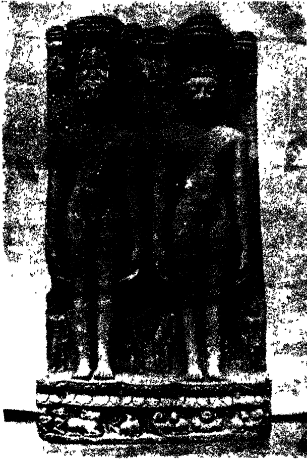
FIRST TIRTHANKAR LORD RISHABHDEV